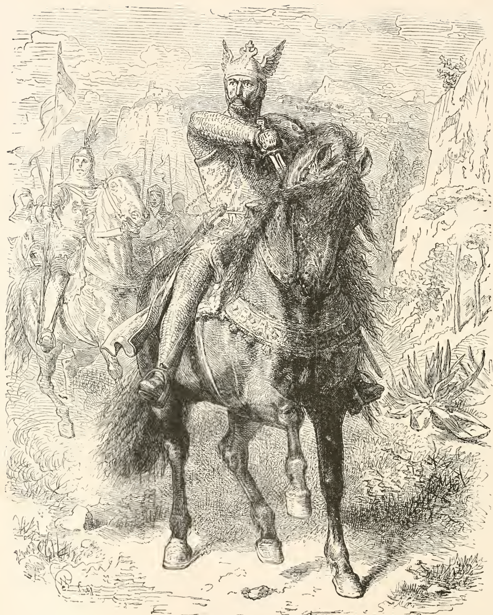
MARMION. — Page 83.